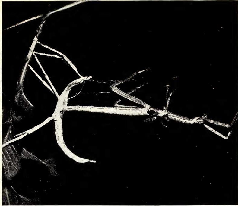
All legs clear. Tip of body firmly held in old skin. This position is maintained for an hour or more until skin and legs harden. Wings do not commence to grow until position is reversed.